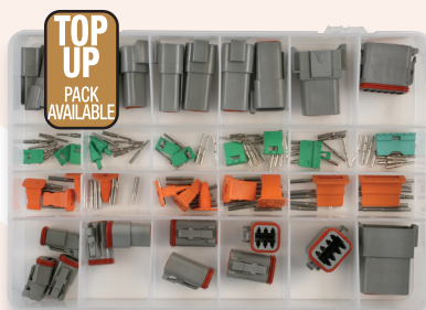
Assorted Deutsch DT Connector Kit 22pc 37415