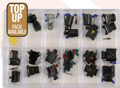
Assorted BMW/ Mercedes Electrical Connector Kit 24pc 37409