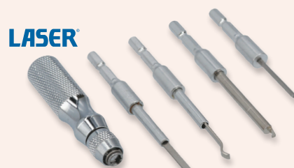
Terminal & Connector Tool Set 5pc 7807