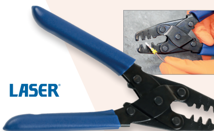
Open Barrel Crimping Pliers 7642