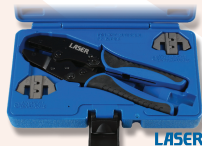
Ratchet Crimping Tool - for Supaseal Connectors 7002