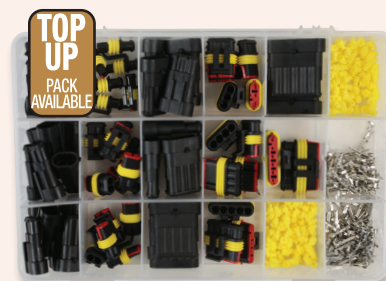
Assorted Automotive Electric Supaseal Connector Kit 424pc 37225