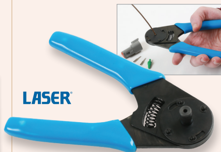
4 Way Indent Crimping Tool 7533