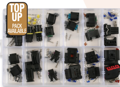
Assorted BMW/ Mercedes Electrical Connector Kit 24pc 37410